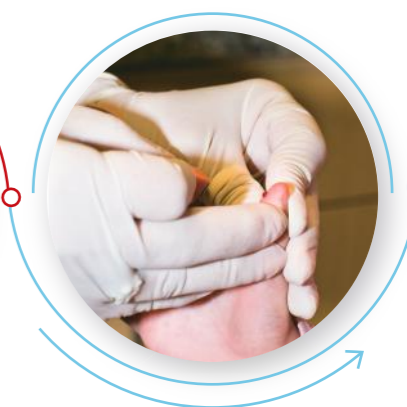
Perfect for pediatric samples